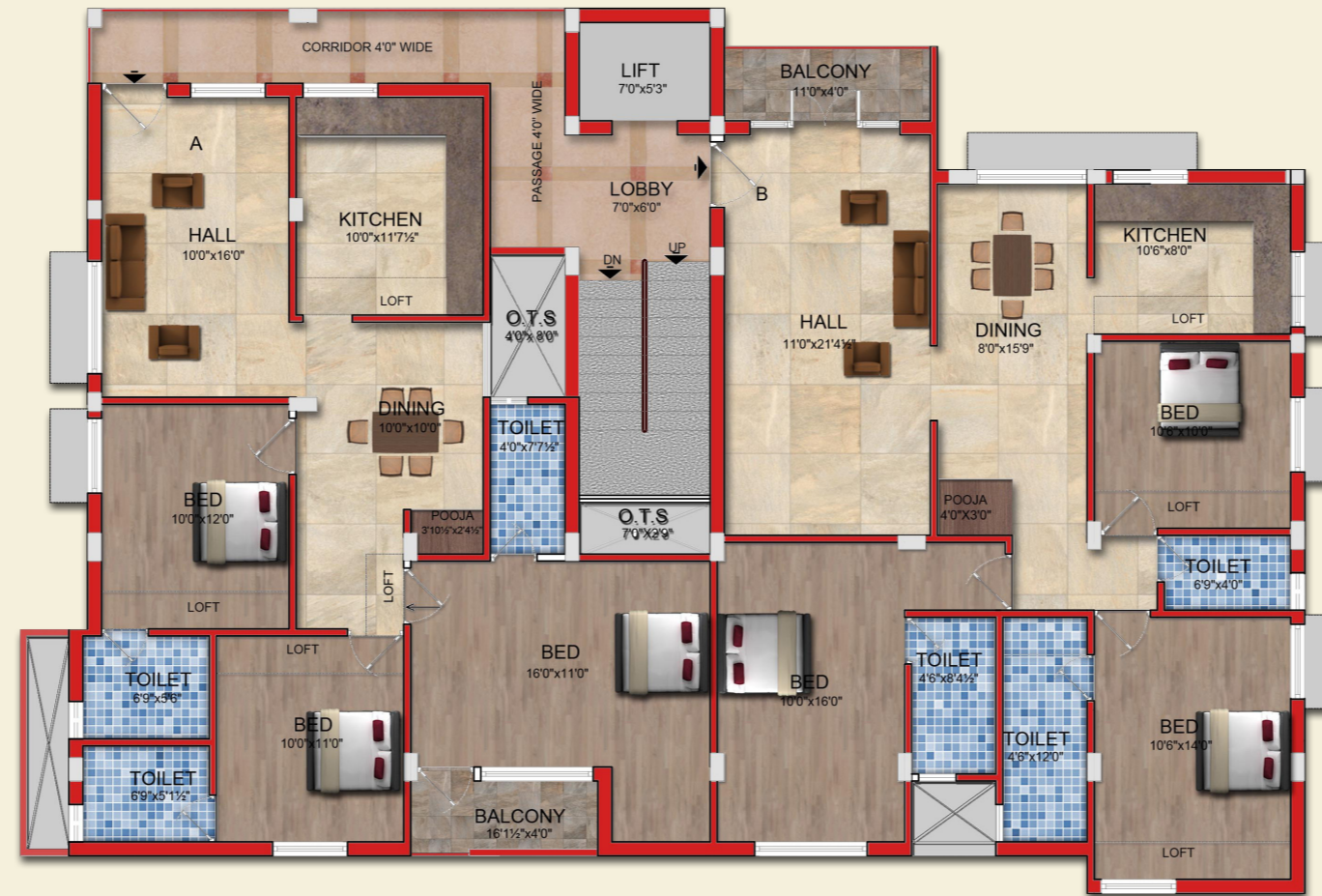
FLOOR PLAN ( 1,2,3 & 4 )